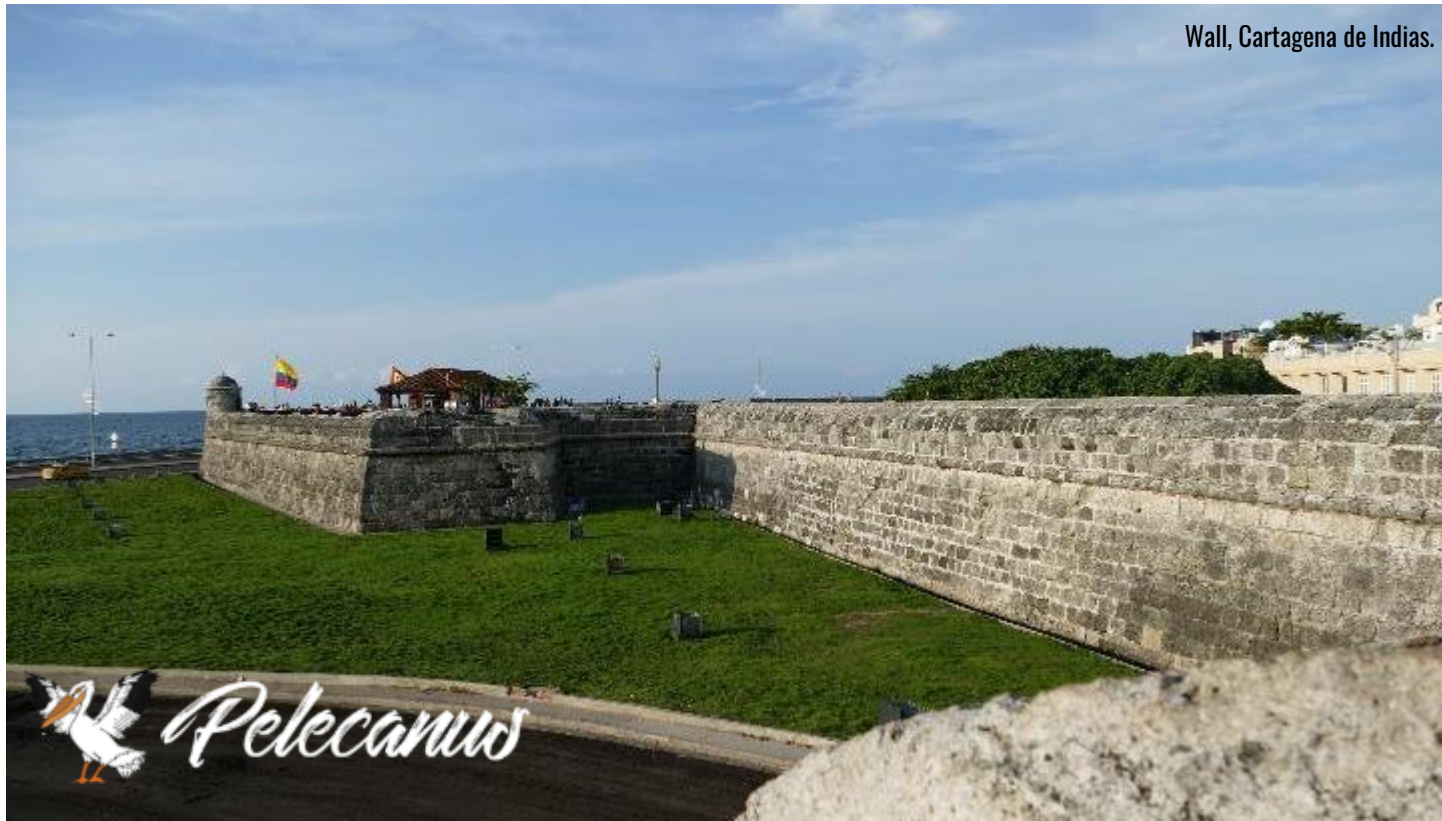
Wall, Cartagena de Indias.