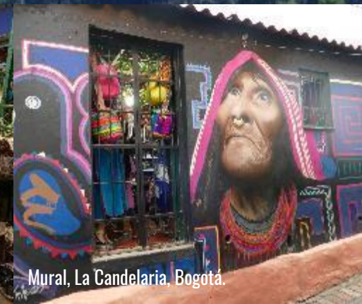
Mural, La Candelaria, Bogotá.