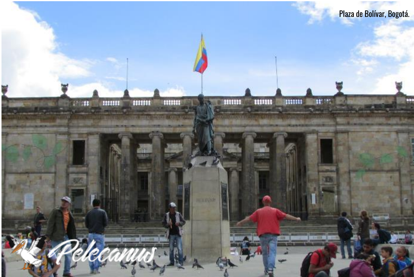
Plaza de Bolívar, Bogotá.