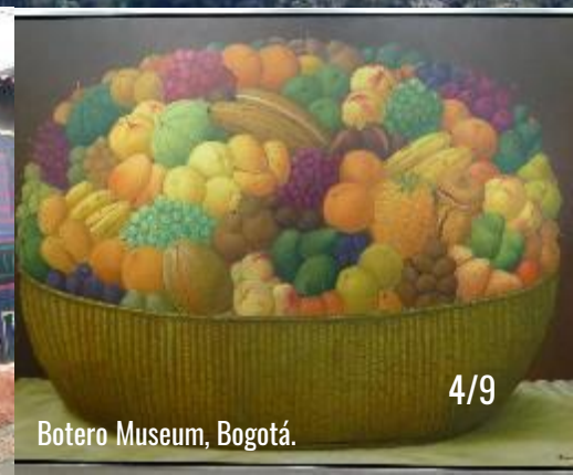
Botero Museum, Bogotá.