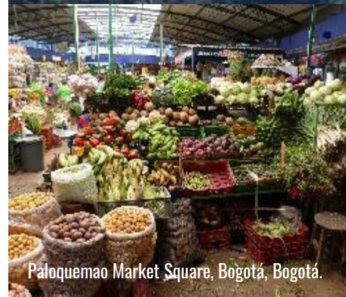
Paloquemao Market Square, Bogotá, Bogotá.